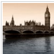
London's Dark Underworld