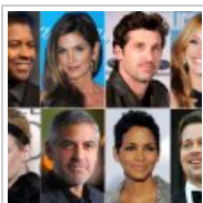
The Most—and Least—Attractive States