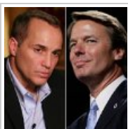
Andrew Young's Revenge