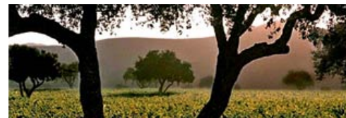
4 budget-friendly getaways close to Southern California. Photos

Cut down 3 lbs of your belly every week by using this 1 weird tip. FatBurningFurnace.com