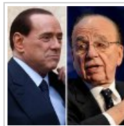
Murdoch's Italian Offensive