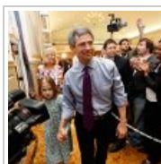
A Big Night for the Left