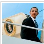
Obama's Awkward Homecoming