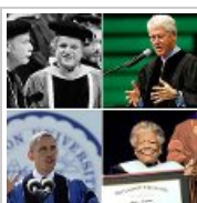
The 30 All-Time Graduation Speakers